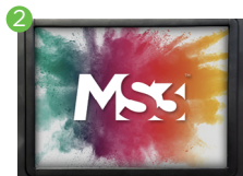
10 or 7-in. Display